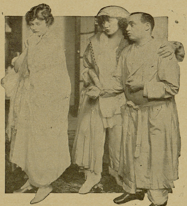
Scene from "PARLOR-BEDROOM AND BATH" LYRIC THEATRE, FRIDAY, JANUARY 16.