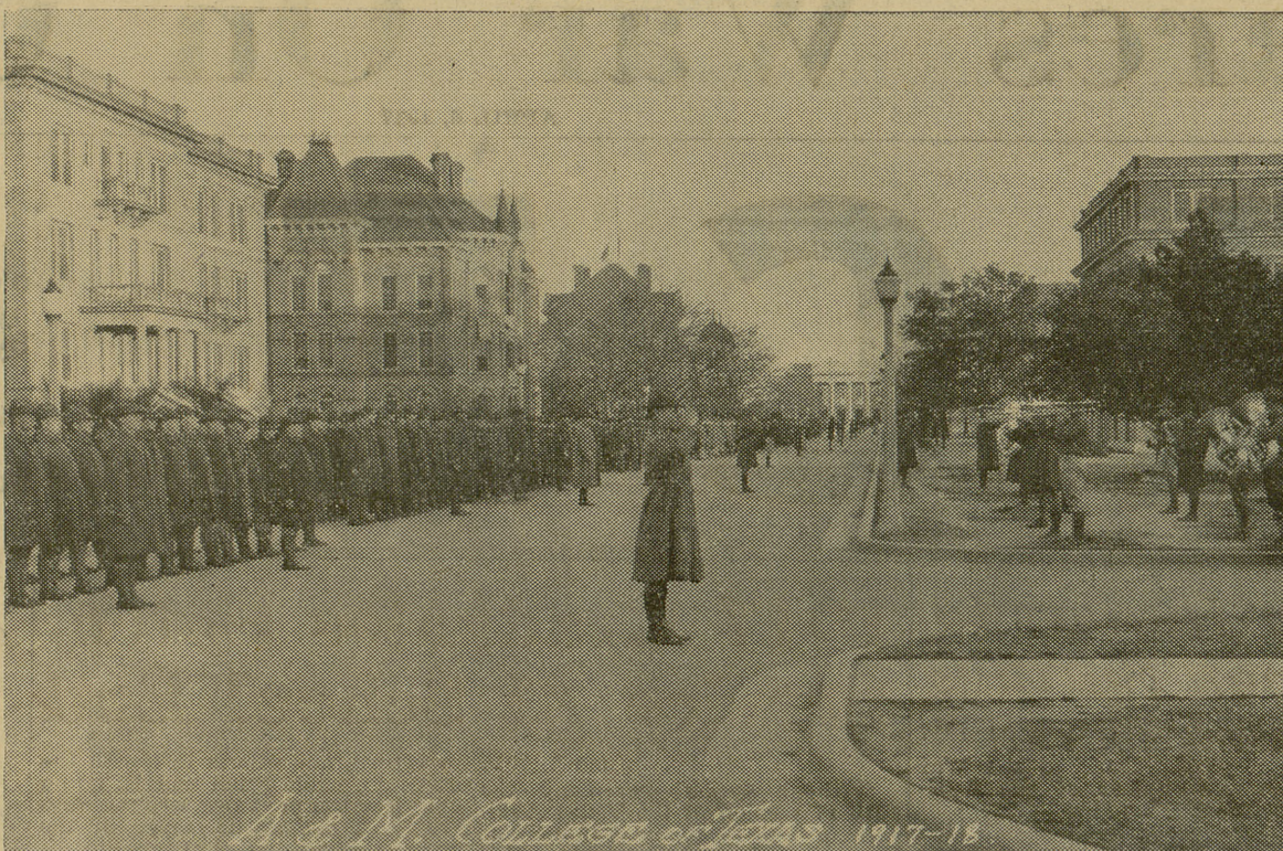
Retreat formations were held on Military Walk before marching into Sbis Hall for the evening meal in 1917. Building on the left is the Old