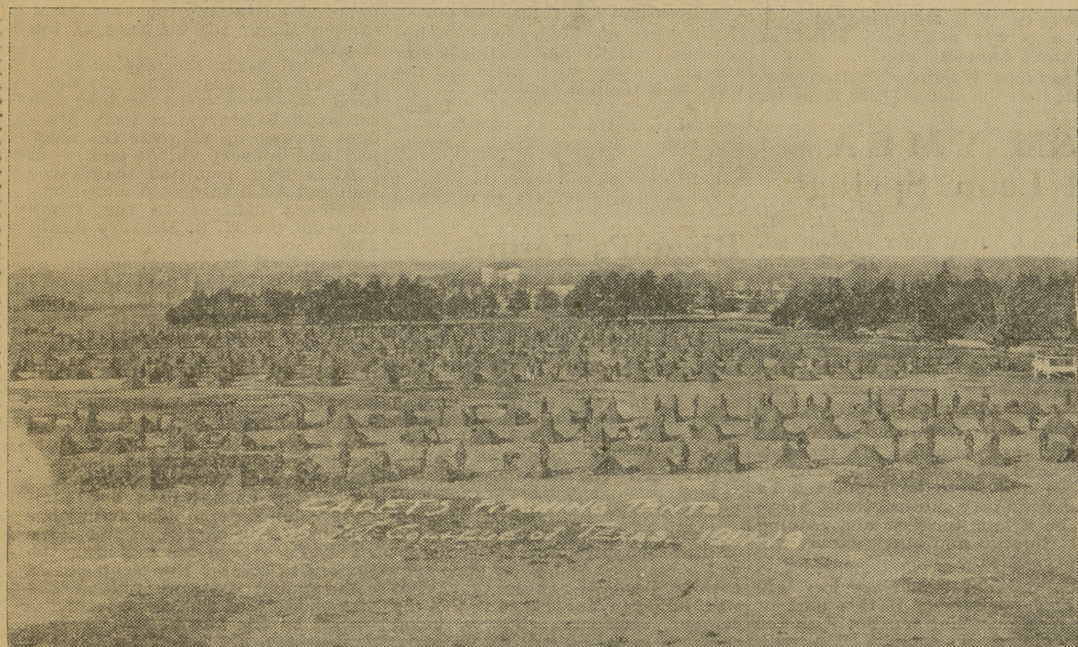
Cadets pitch tents for practice in 1917. Housing was not the problem, the Military Department