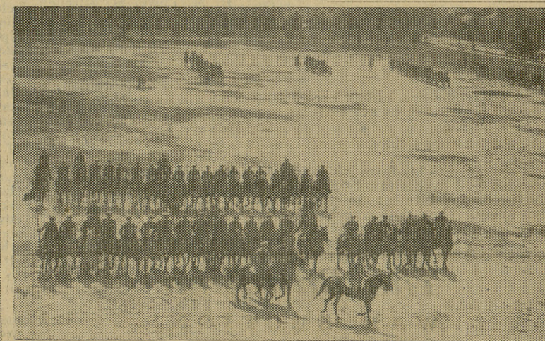
Files of horses perform a right turn during the drill period in 1917. The Horse Cavalry was done away with at A&M at the time of World War II.