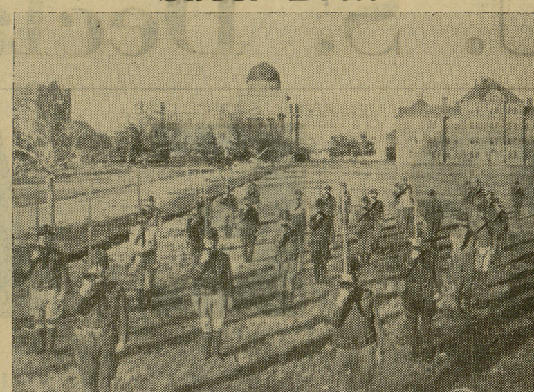
Officers in the Corps in 1917 go through Saber Drill on the main drill field. During this period the officers carried the regular heavy duty cavalry sword.