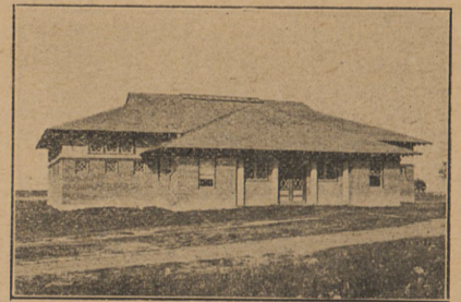
THE DISSECTING LABORATORY