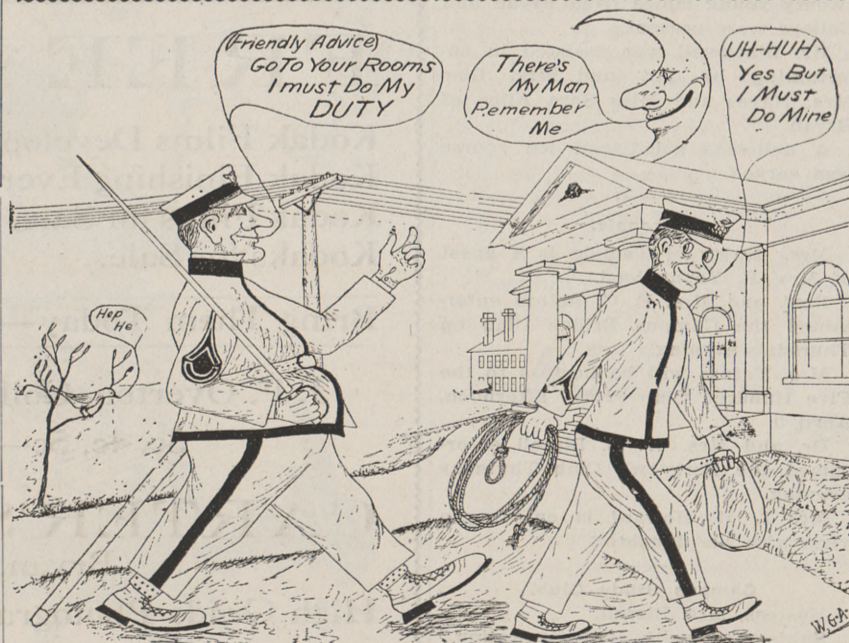
On the Night of the Junior Banquet.

"Fish" Brooks (with the dignity of a judge)—If only one finger can be placed between the pelvic bones, is that a sign of a rooster?