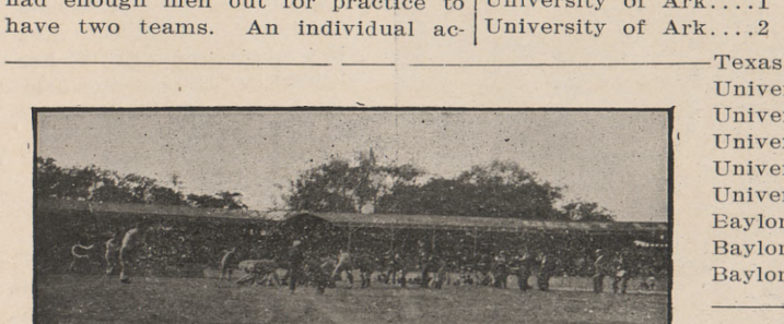
An Exciting Moment.

points ...27-A. & M.125 A larger amount of enthusiasm was displayed in the company football games this year than has ever been shown before. Each company always had enough men out for practice to