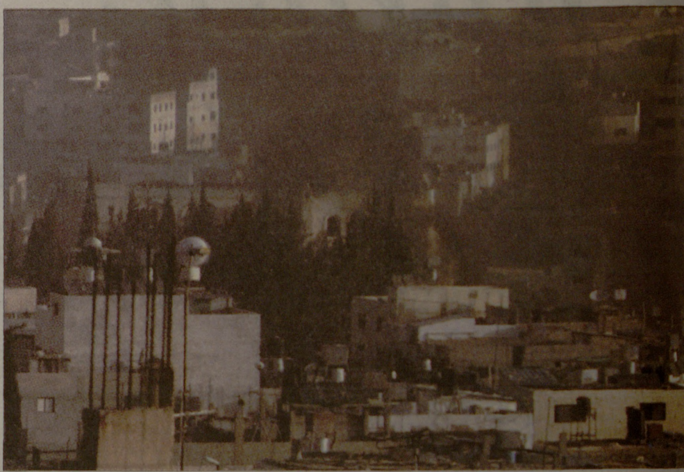
Smoke rises from the city of Balata after Israeli troops attacked two refugee camps. Troops went house-to-house in the camps, killing 12 people.

To advertise on this page call The Battalion today! 845-2696