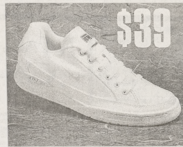
Nike® Courtster men's canvas court shoe in white/navy, sizes 7-12, 13, 14M. Sizes 7-12M in black/white.

EXCLUSIVELY AT DILLARD'S! DYNAMIC CUSHIONING EVA SOCKLINER INDY 500 PLUS OUTSOLE Reebok Diana women's aerobic shoes in white leather, sizes 6-10M.