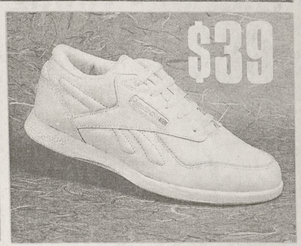
Reebok Comfort Ultra polyurethane walking shoe. Women's sizes 6-10N, 5-10, 11M, 6-10W in white. Men's sizes 61/2-12, 13, 14M and 81/2-12W in white; 71/2-12, 13, 14M and 81/2-12W in sport white; 7-12, 13, 14M and 81/2-12W in black.