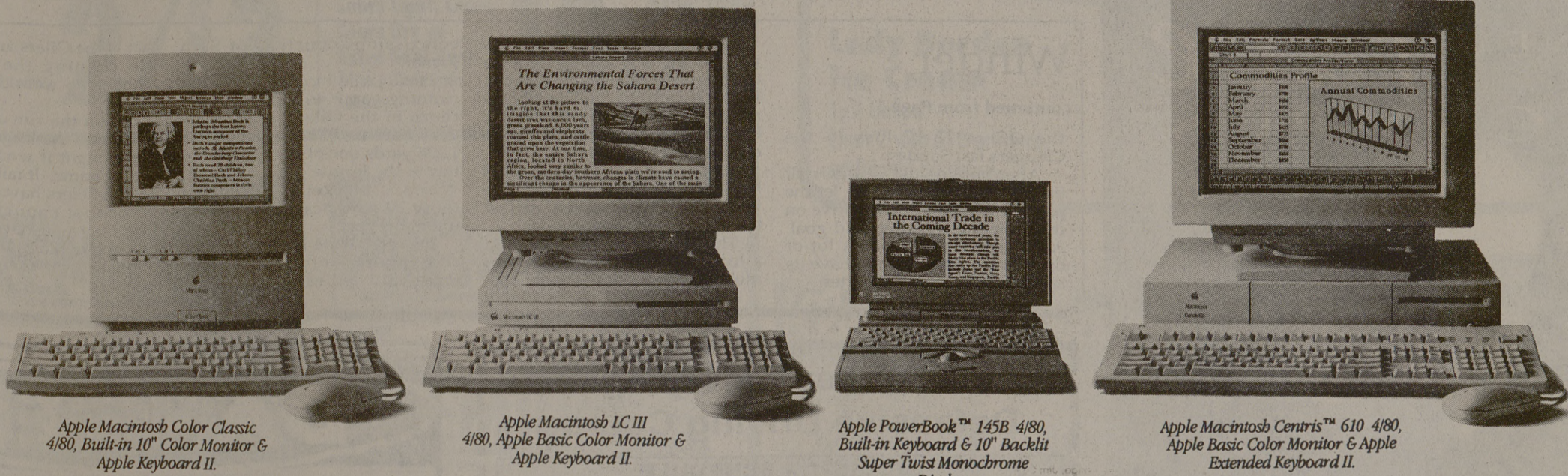
Apple Macintosh Color Classic 4/80, Built-in 10" Color Monitor & Apple Keyboard II.