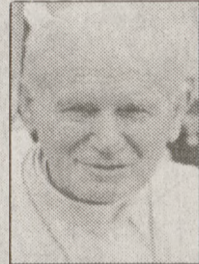
John Paul II

VILNIUS, Lithuania — Pope John Paul II reached out Sunday to the Russian Orthodox Church, and warned against the revival of ancient European divisions and a desire to avenge modern-day oppression.