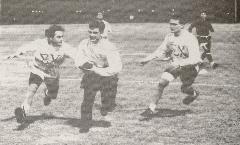
Registration begins today for intramural flag football!

Registration and fees are taken in 159 Read, Mon.-Thurs., 8 a.m. - 5:30 p.m., Fri., 8 a.m. - 5 p.m. Cash, local check, Visa, MasterCard, and Discover accepted.