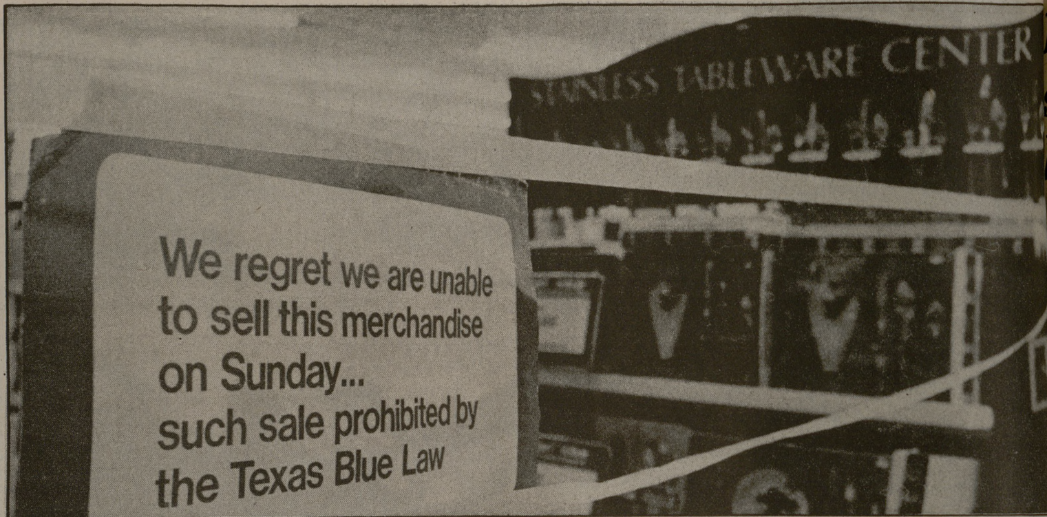
Texas retail store spokesmen want customers to voice their opinions about the blue law to their legislators. A retail store spokesman said that store personnel are tired of trying to