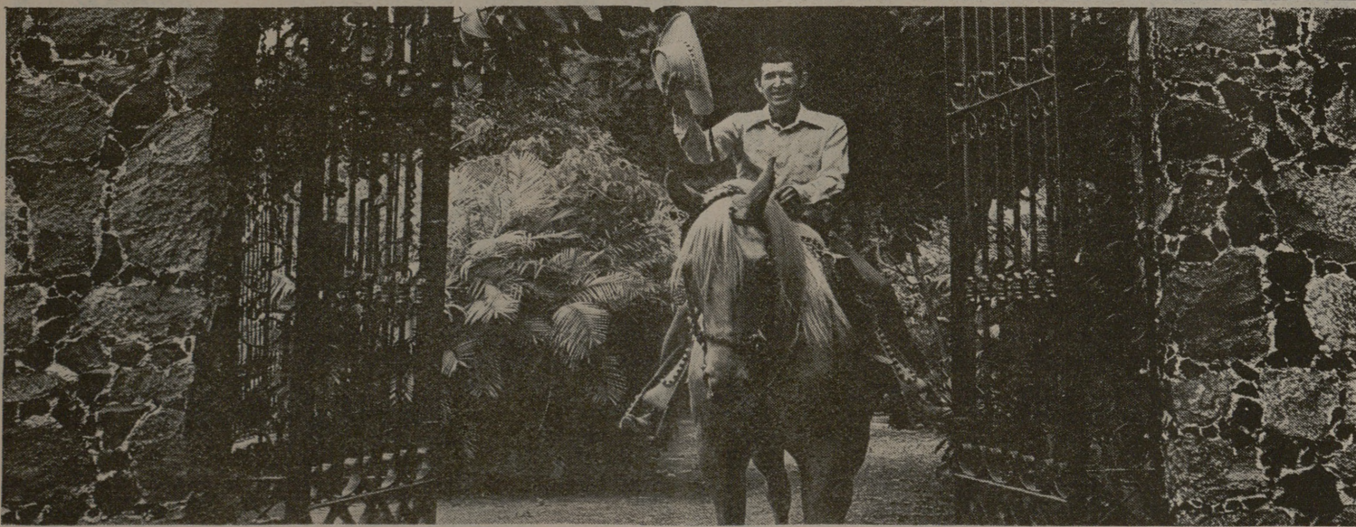
Next time you're in Mexico, stop by and visit the Cuervo fabrica in Tequila.

Remember - our regular prices for precision cuts without shampoos and blowdry's are $7 for men and $9 for women. Come check us out. Offer good through March 15