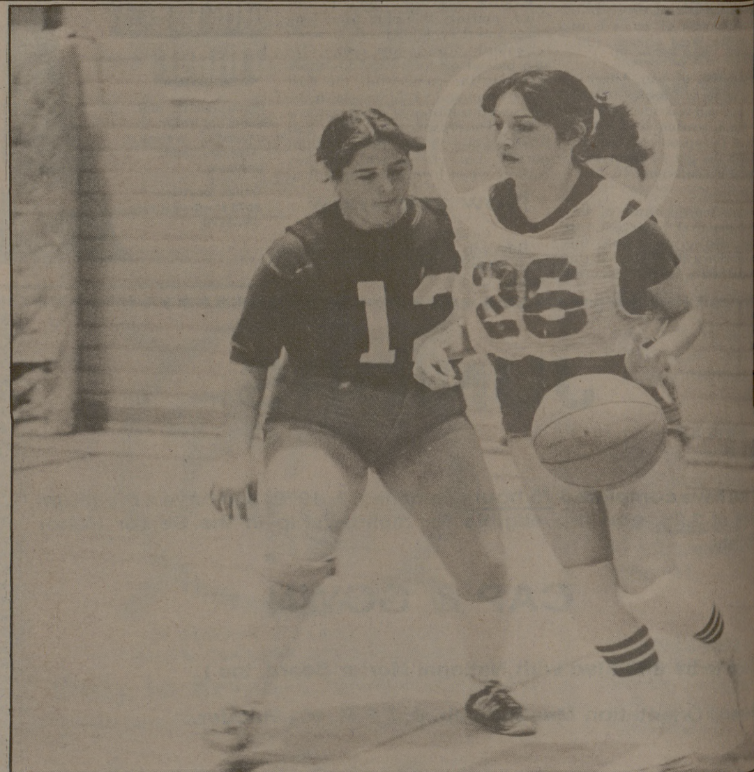
"I-Spy" Participant Of The Week

Dates, places, and tournaments are subject to changes and cancellations.