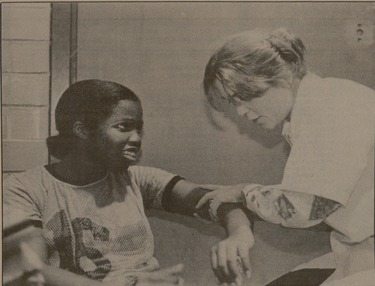
Help is nearby if you need it during an intramural game thanks to the Emergency Medical Technicians that will be stationed near most games this year. In the picture

Frisbee Tuesday, Feb. 27 Fast Pitch Softball Tuesday, Feb. 27 Racquetball Tuesday, Feb. 27 Play begins Horseshoe Doubles Monday, Feb. 12 Tennis Doubles Monday, Feb. 19 Special Events Fencing Tournament 10:00 a.m. Feb. 24 Saturday, DeWare Fieldhouse