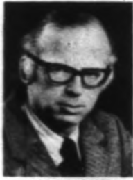
David S. Broder

We support the bond issue and urge its approval. To delay a solution any longer would be an insult to the educational process.