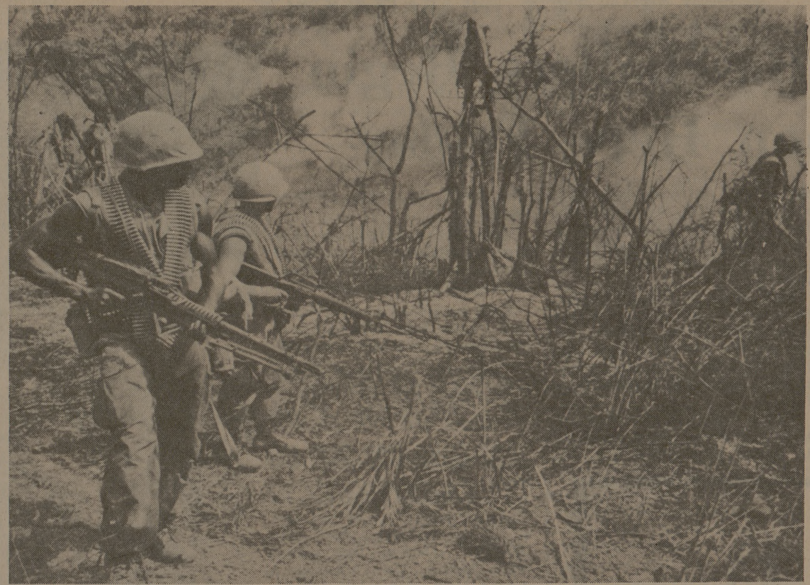
AIR STRIKE FOLLOWUP Two 7th Regiment Marines sweep through Viet Cong positions following an hour-long air strike. Trying to block infiltration routes to Da Nang, the Marines poke through bunkers and spider holes, discovering 11 bodies.

STUDY IN CUERNAVACA Learn to speak SPANISH • Intensive courses, with drills, supervised labs, and theory taught by experienced Mexican teachers. • $135 per month. Study in the INSTITUTE FOR CONTEMPORARY LATIN AMERICAN STUDIES . • Examine themes such as "Protest and its Creative Expression in Latin America" and "The Role of Education in Social Change" in 10 to 30 new courses each month. • Access to excellent library. • $30 per credit. Live in CUERNAVACA • Near Mexico City, at 4,500 feet elevation, with Mexican families or in dorms or bungalows. • Approx. $80 per month. Request catalog from Registrar — Cidoc W. Godot, Apdo. 479, Cuernavaca, Mexico