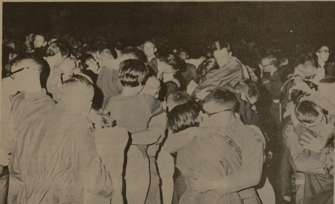
MIDNIGHT YELL PRACTICE BECOMES AN AGGIELAND "LOVE-IN."

When a cadet has a problem he can go to his upperclassman, because they can and will help him, whether his problem is academic or others.