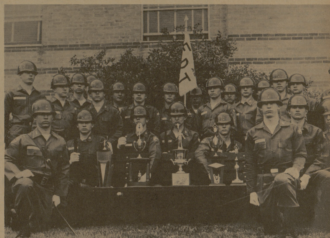
AS SHARP AS SATURDAY ... Fish Drill Team poses with array of trophies