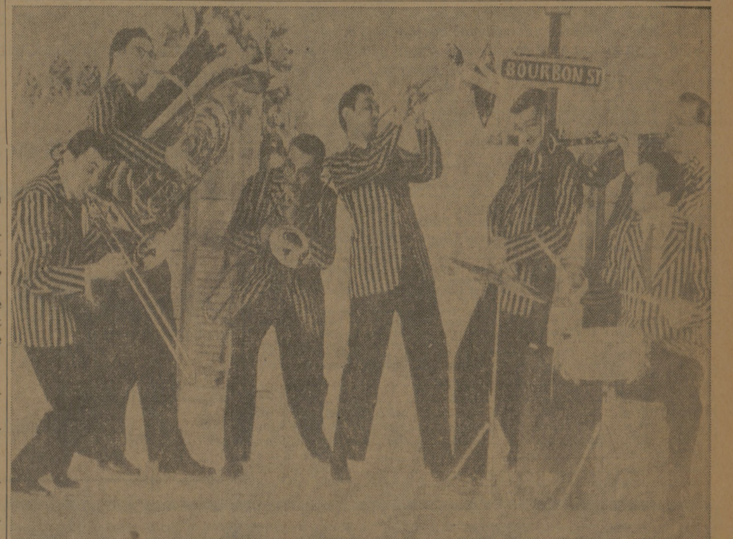
Dukes of Dixieland

The Dukes of Dixieland have accepted an invitation to play for an all-college dance brought to Aggieland by the Memorial Saturday, Sept. 24 after the Texas Tech Student Center Music Committee.