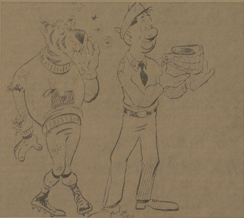
Louisiana State, A&M Grid Opener... off to a good start?

A glassed-in lobby is still another feature of the new project.