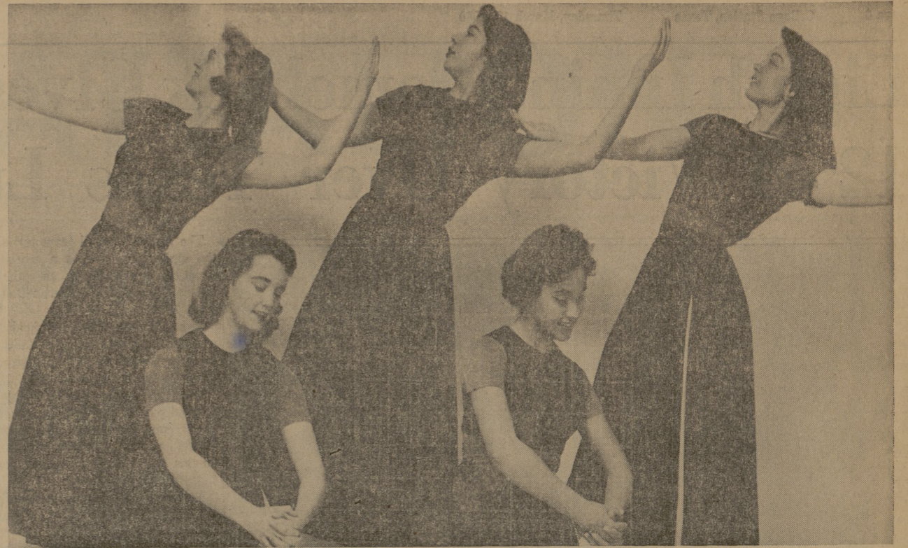
Members of the Texas Woman's University Modern Dance Group are shown here in a scene from "Little David, Play on Your Harp," from the Negro Spiritual Suite. This will be one of the many numbers performed by the Modern Dance Group when they appear Friday, March 25, at 8 p. m.

Following the discussion, members of the AAUP will conduct a business meeting.