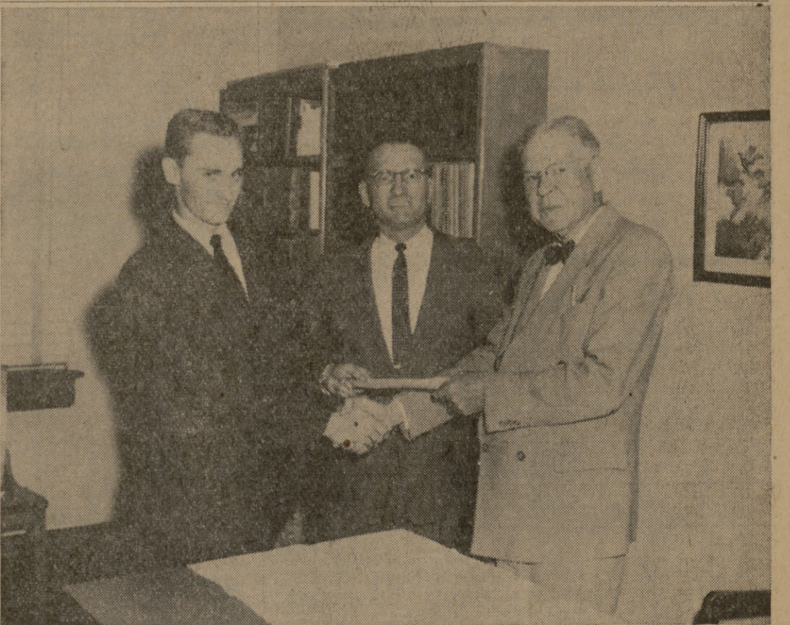
Gift From Class of '59

The event, along with the 38th annual Aggie Rodeo, will kick-off a weekend filled with activity, including the Aggie-Baylor Southwest Conference grid clash Saturday afternoon.