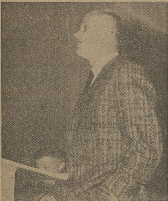
Aggie Captain Speaks

The biggest reward for a thing well done is to have done it—Ralph Waldo Emerson