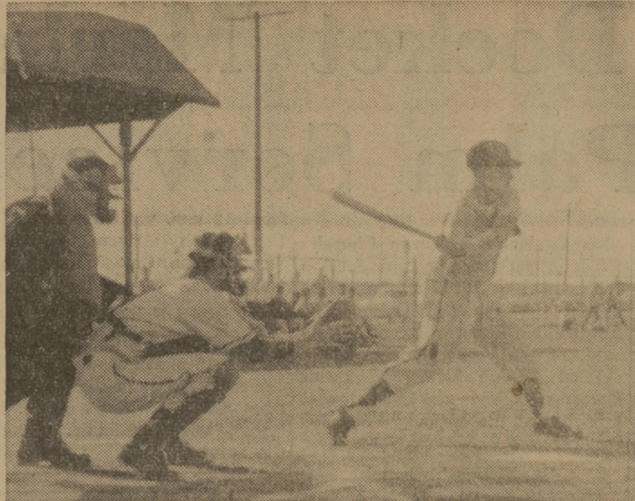
Here It Comes!