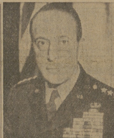
Gen. Lyman L. Lemnitzer

The Ross Volunteers will serve as ushers for the guests and the Fish Drill Team will act as the honor guard for the (See ITS OPENS, Page 4)