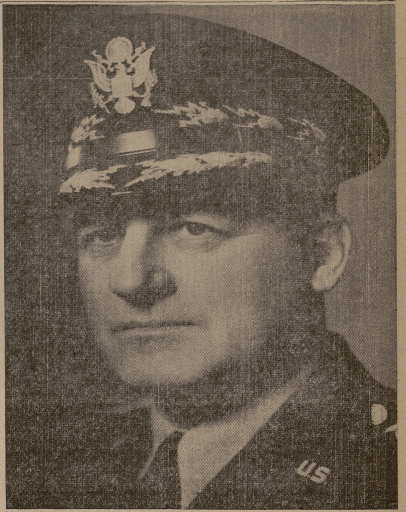
Gen. Nathan F. Twining Top AF General

His decorations include the Distinguished Service Medal, Navy Distinguished Service Medal, Legion of Merit with one Oak Leaf Cluster, Distinguished Flying Cross, Bronze Star, Air Medal with one Oak Leaf Cluster, French Croix de Guerre with two Palms and the French Legion of Honor and Knight of the British Empire.