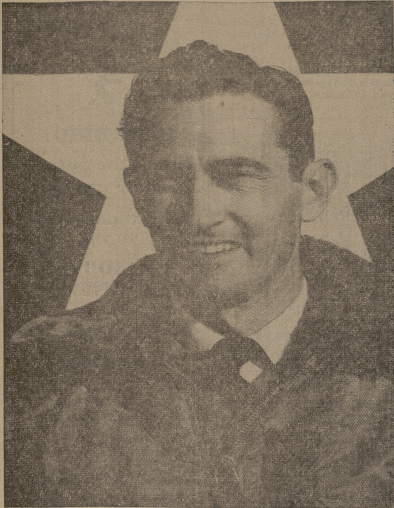
Col. Royal N. Baker Top Jet Ace