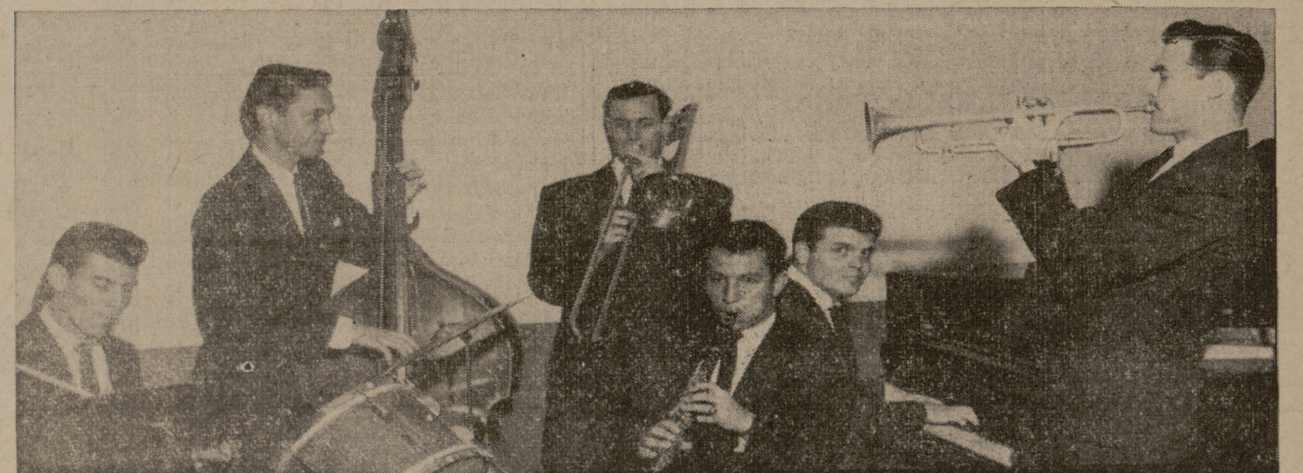
Knights of Dixieland, from Southwestern Louisiana Institute