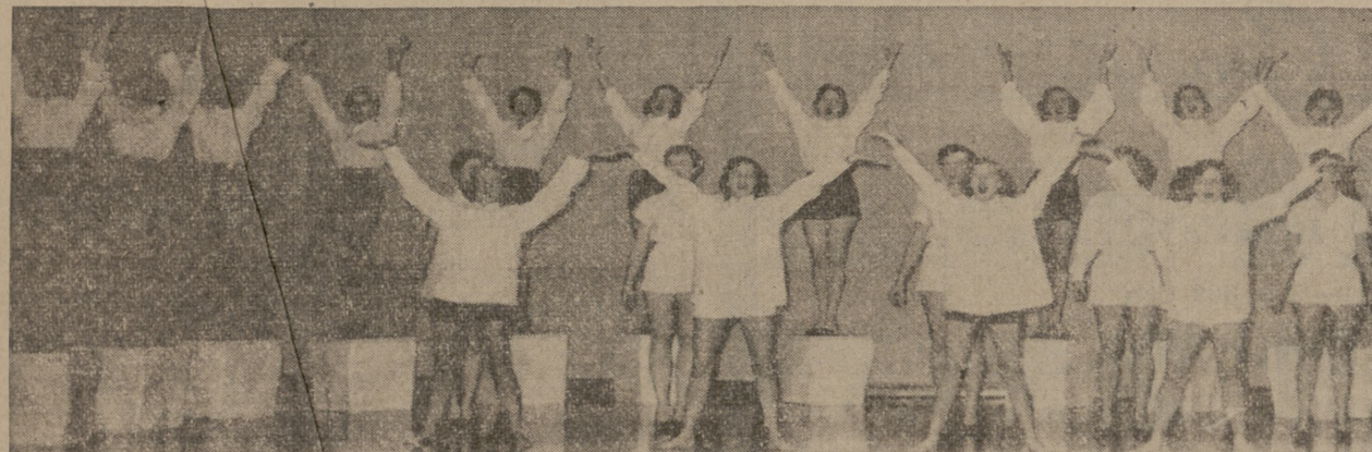
"Brrrr!" Chi Omega Sorority from Oklahoma University