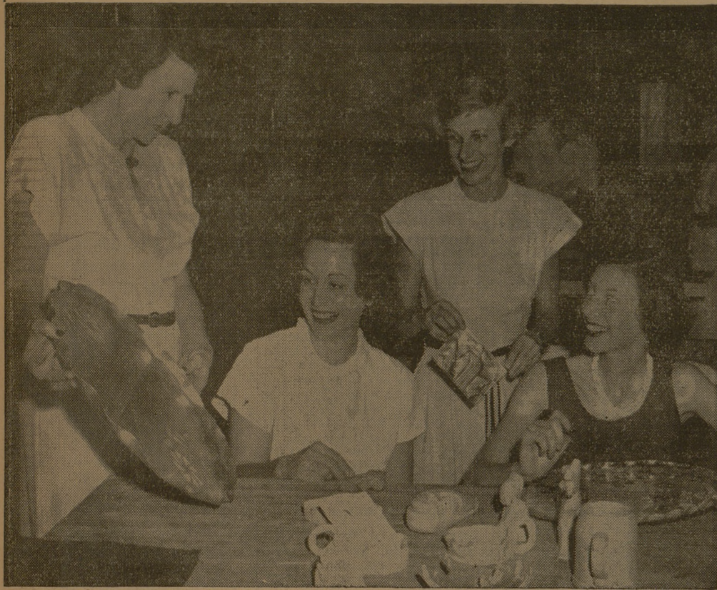
Members of the handicraft group of the summer recreation program proudly show these pieces of craftsmanship which they made from clay and aluminum, last year. The group will meet each Monday and Thursday at 7:30 p. m.