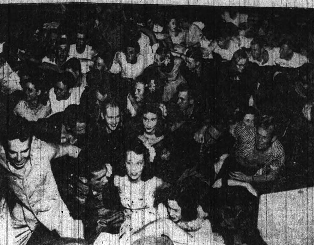
MIDNIGHT YELL PRACTICE showing A&M in all its pomp and glory was held Friday night to open Sports Day on the campus. Attending the yell practices on the steps of Goodwin Hall were Junior Prom guests and high school leaders from throughout Texas.