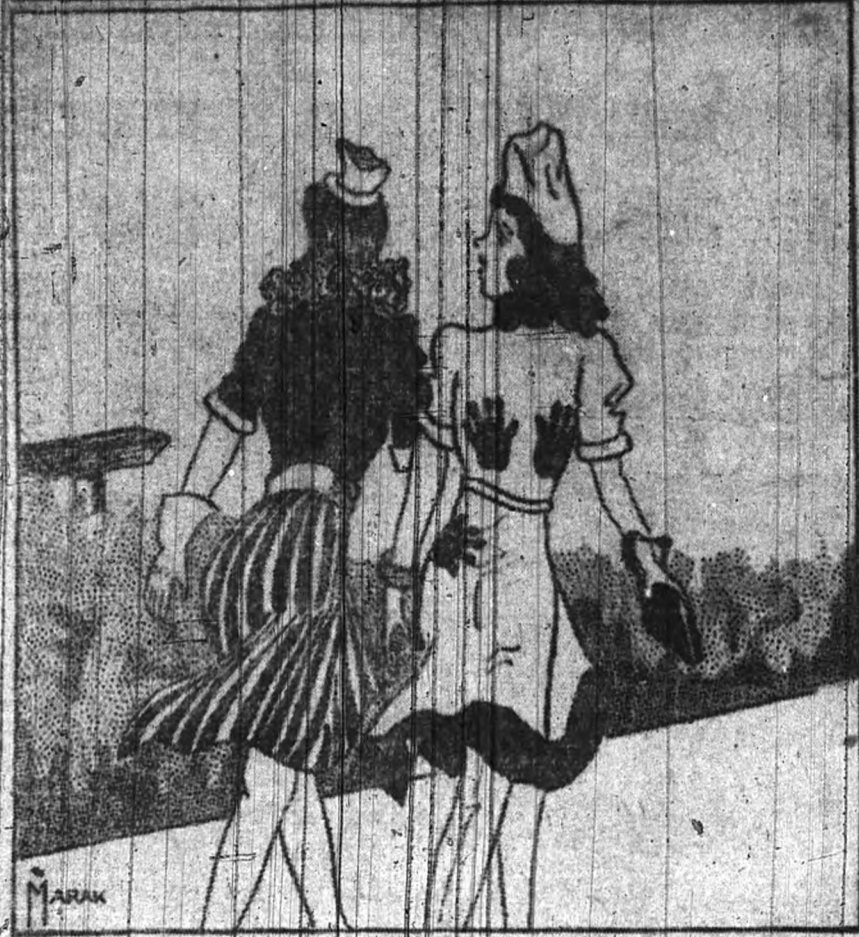
"So, I says to this Aggie, take your dirty hands off me."