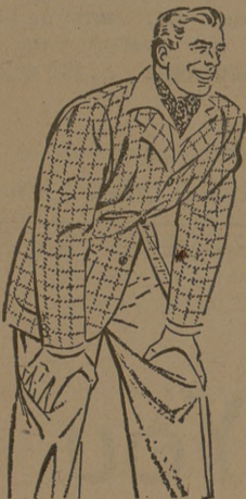
How to be a "good sport..."