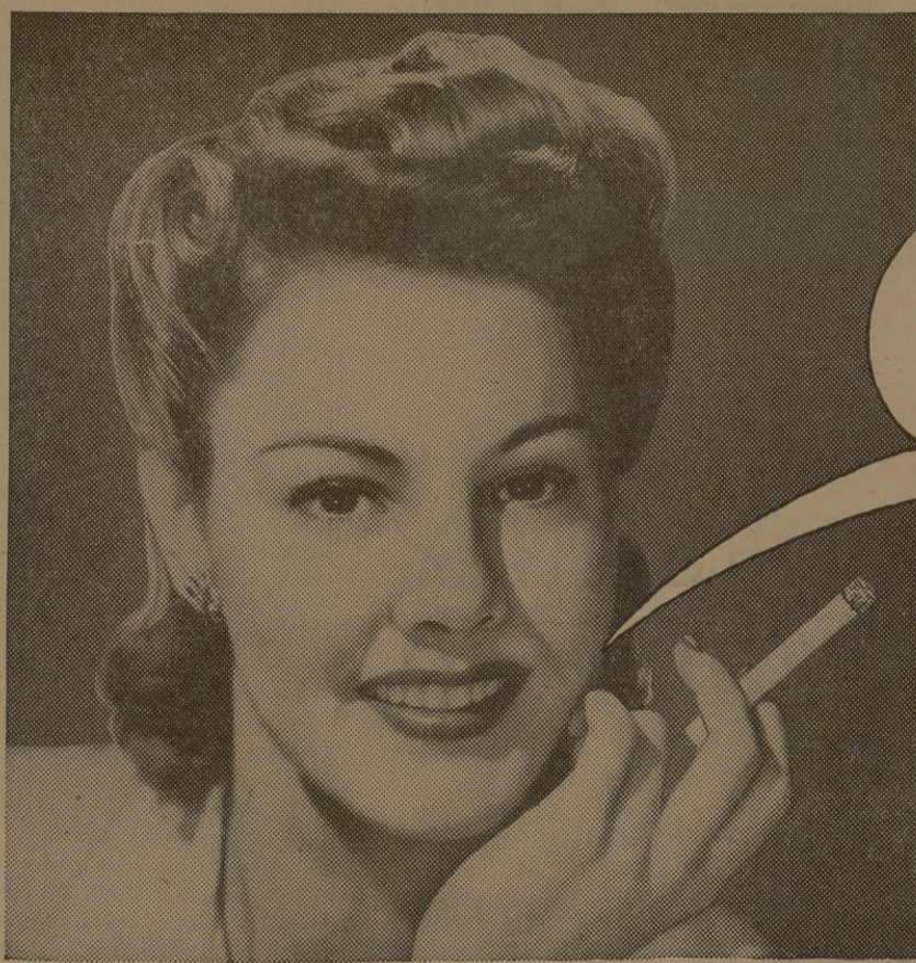
R. J. Reynolds Tobacco Company, Winston-Salem, North Carolina

YES, Camels are milder—milder in every way. When you light up a Camel, you have the scientific assurance of less nicotine in the smoke.